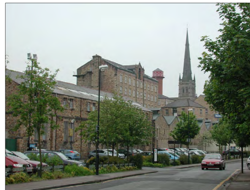
VIEW 3 - EDWARD STREET