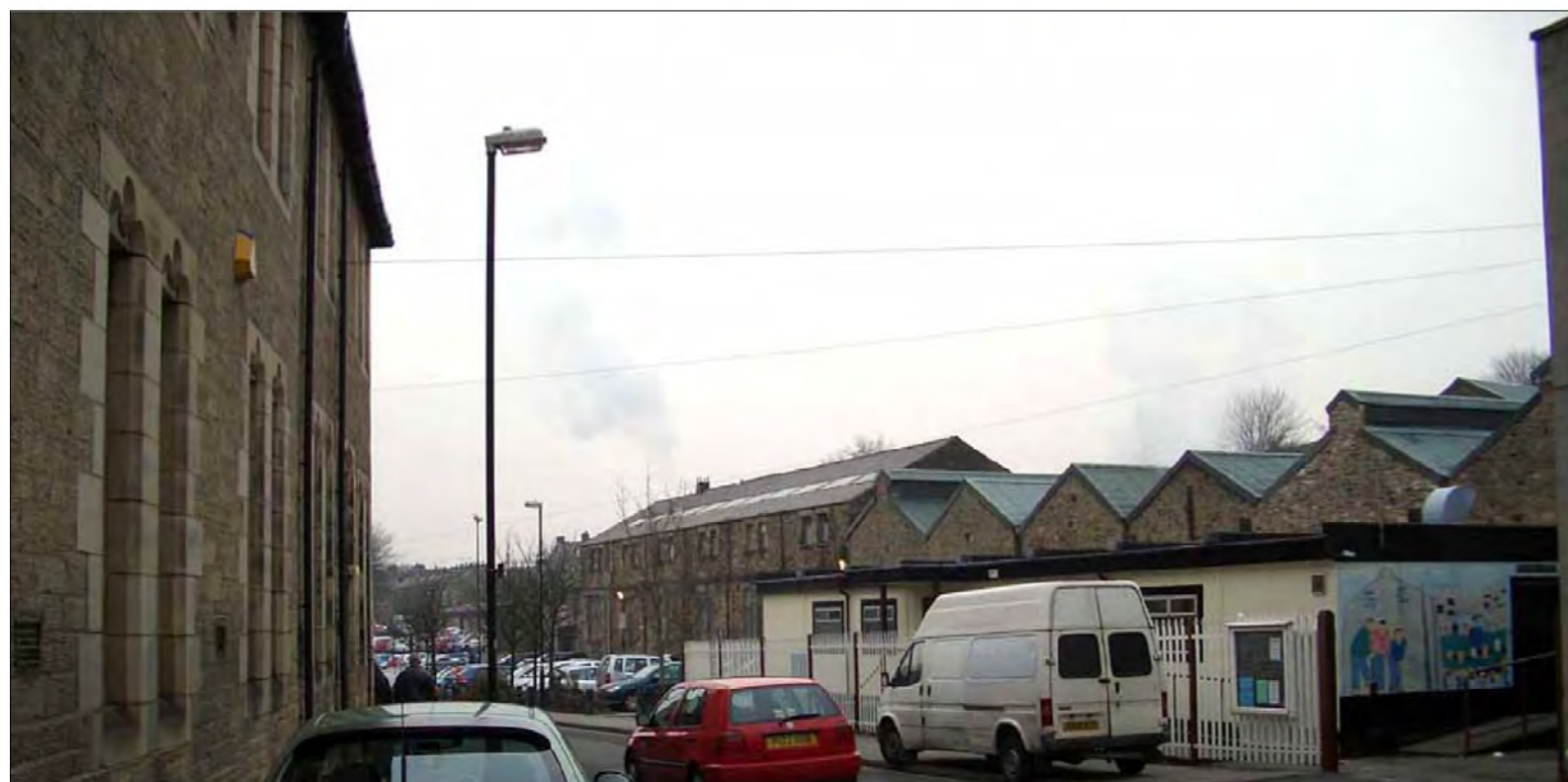
VIEW 2 - MOOR LANE TO EDWARD STREET