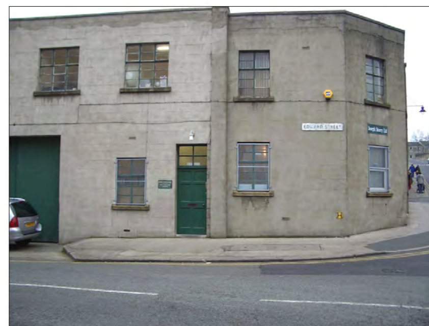
VIEW 5 - JOSEPH STOREY LTD.

REV D 12.02.08 ISSUED FOR COMMENTS. CK REV C 27.04.07 ISSUED TO LANCASTER CITY COUNCIL. CK