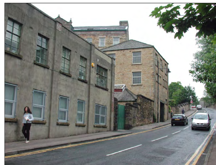
VIEW 4 - MOOR LANE