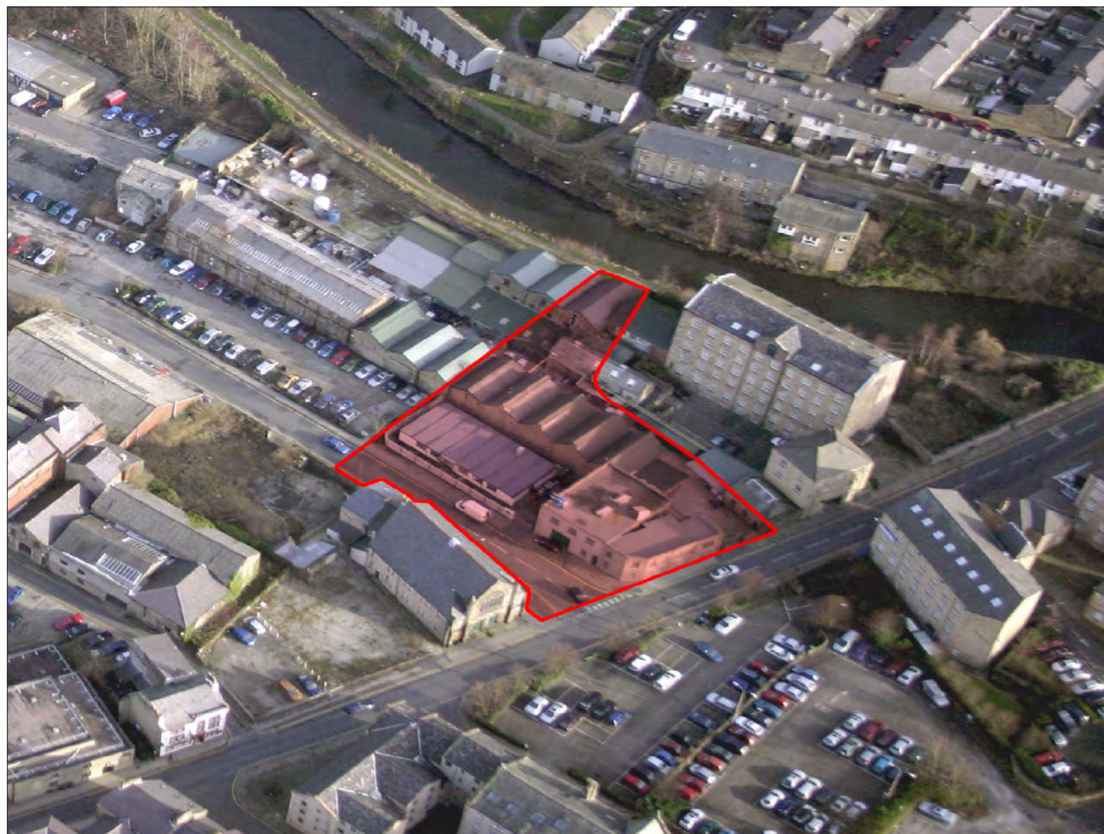
VIEW 1 - AERIAL VIEW OF EXISTING SITE

NOTE: PLEASE REFER TO DRAWINGS 063048-D-103,104,105,106 & 107 FOR EXISTING ELEVATIONS.