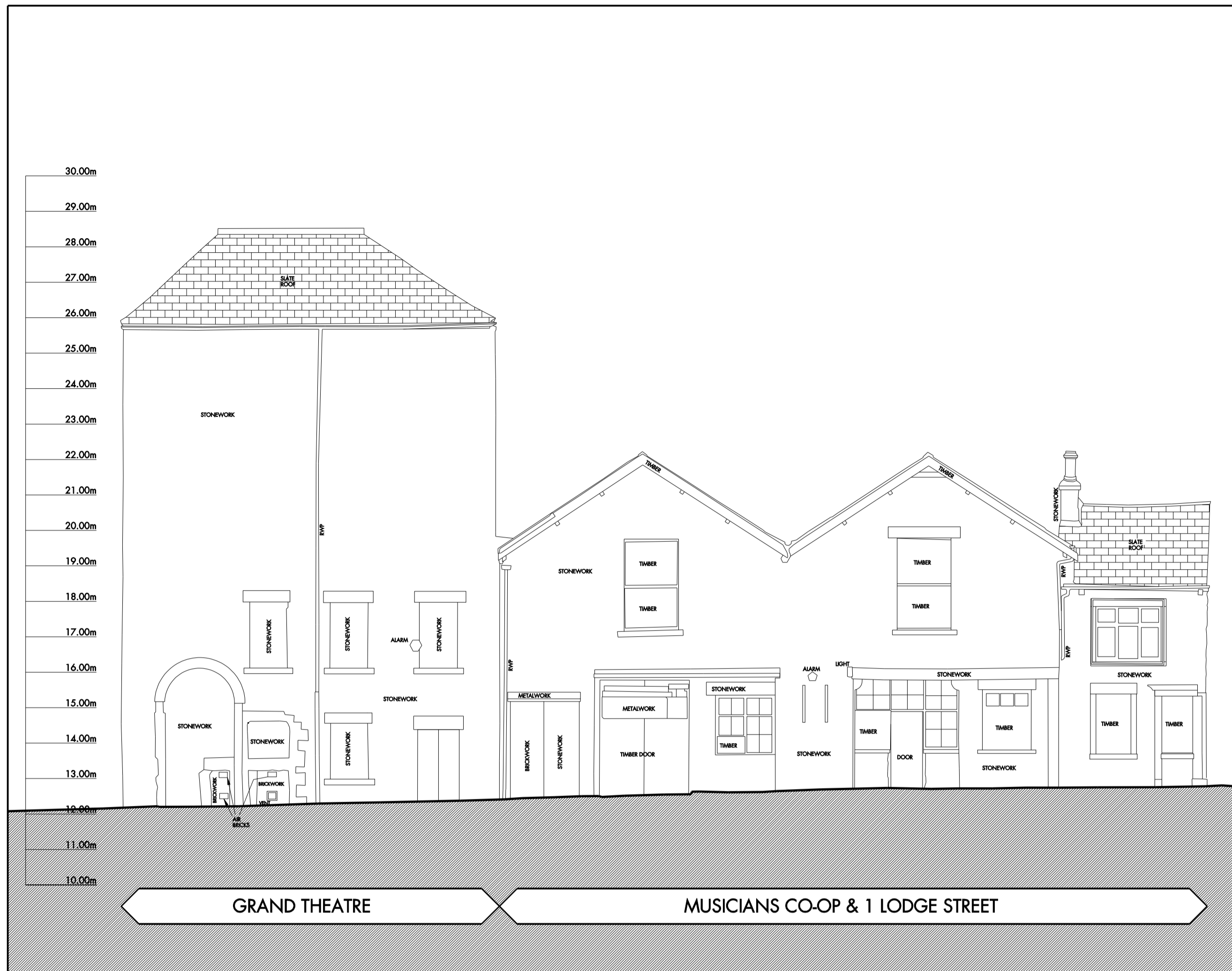
EXISTING ELEVATION B - B