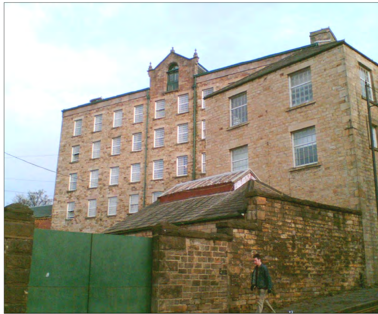
VIEW 2 - VIEW FROM MOOR LANE