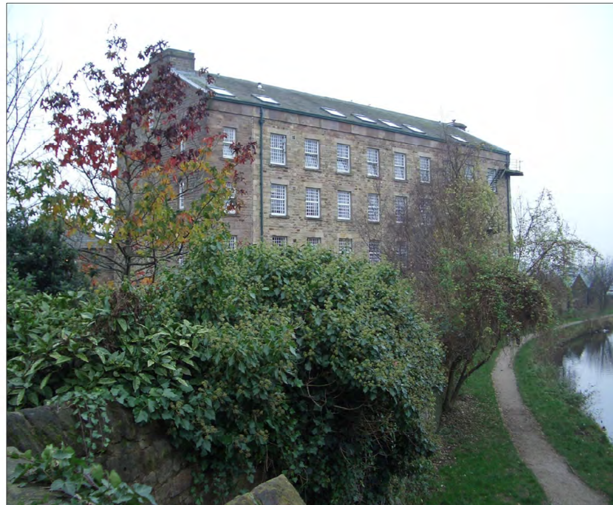
VIEW 4 - MILL HALL FACADE FACING LANCASTER CANAL

REV A 27.04.07 ISSUED TO LANCASTER CITY COUNCIL HW