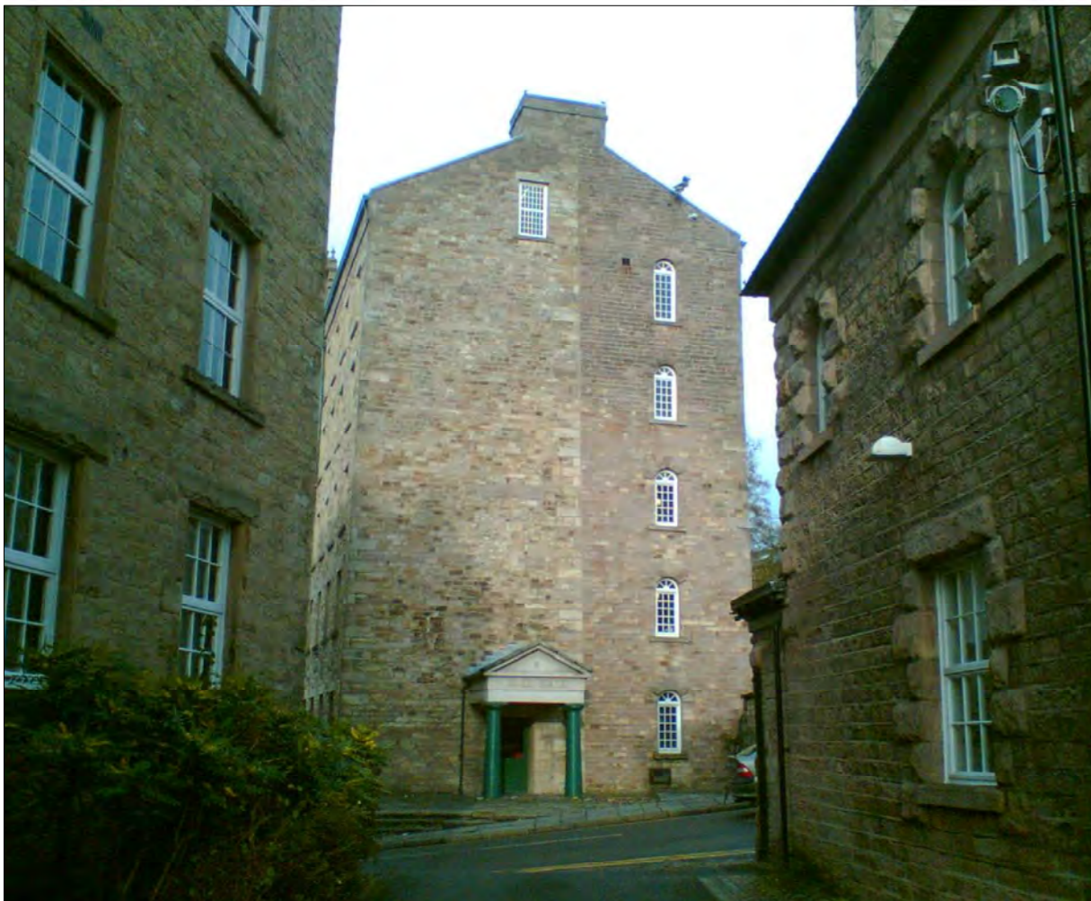
VIEW 3 - MILL HALL FRONT ENTRANCE