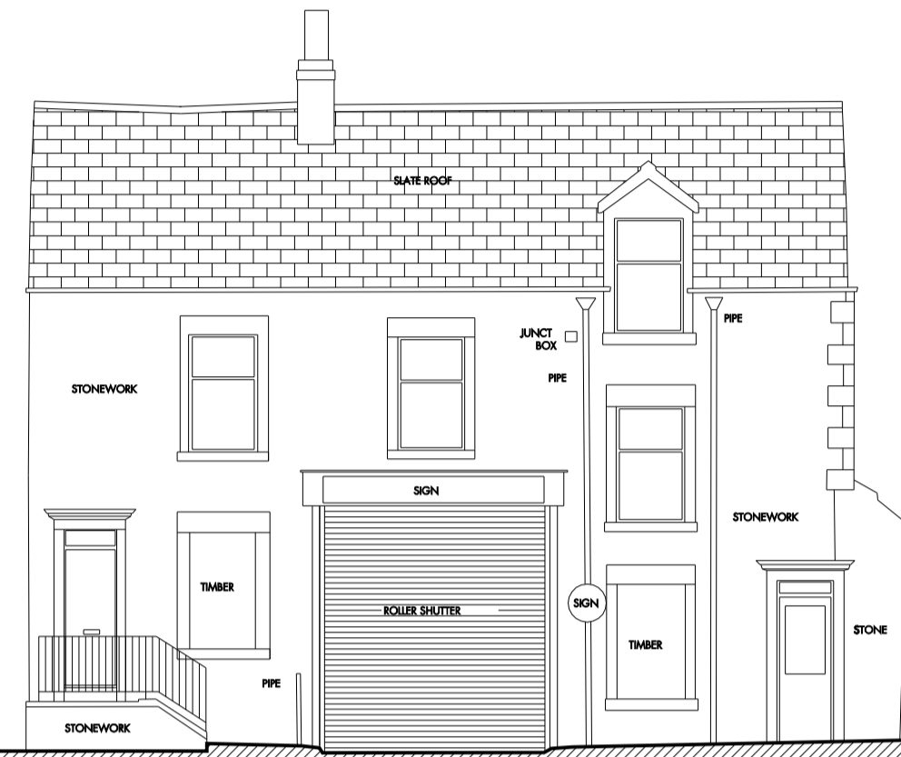
1 & 2 ST ANNE'S PLACE

28.00m 27.00m 26.00m 25.00m 24.00m 23.00m 22.00m 21.00m 20.00m 19.00m 18.00m 17.00m 16.00m 15.00m 14.00m 13.00m 12.00m