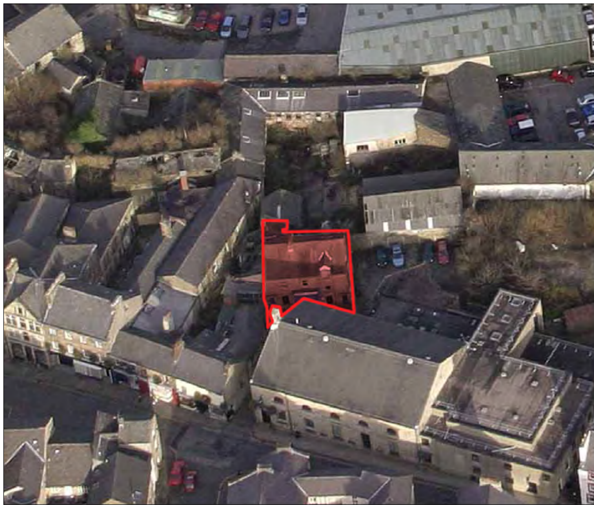
VIEW 1 - AERIAL VIEW OF EXISTING SITE