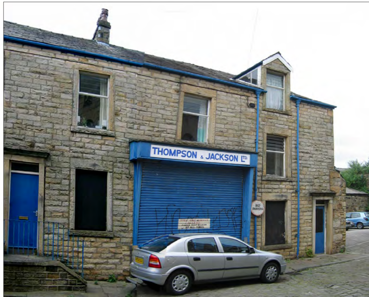
VIEW 4 - FROM ST ANNE'S PLACE