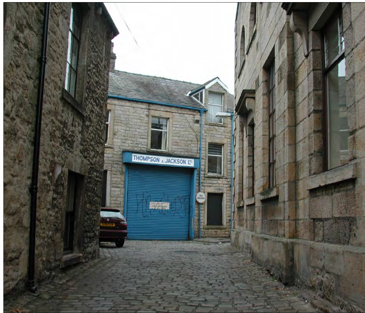
VIEW 3 - FROM ST ANNE'S PLACE