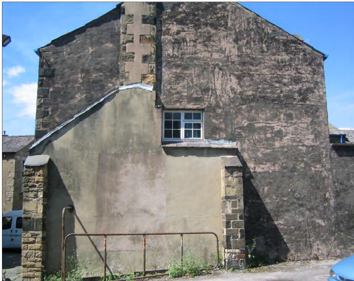
VIEW 2 - NORTH EAST ELEVATION