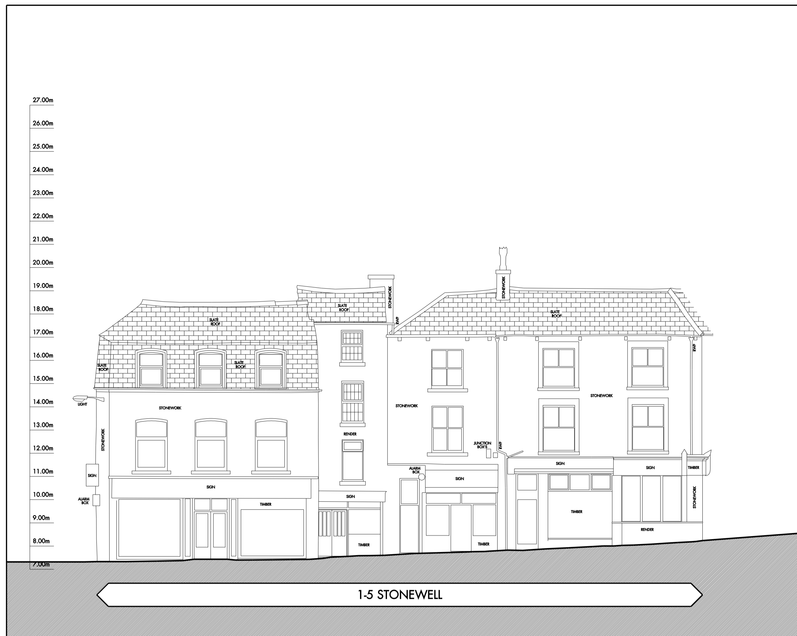
EXISTING ELEVATION B - B