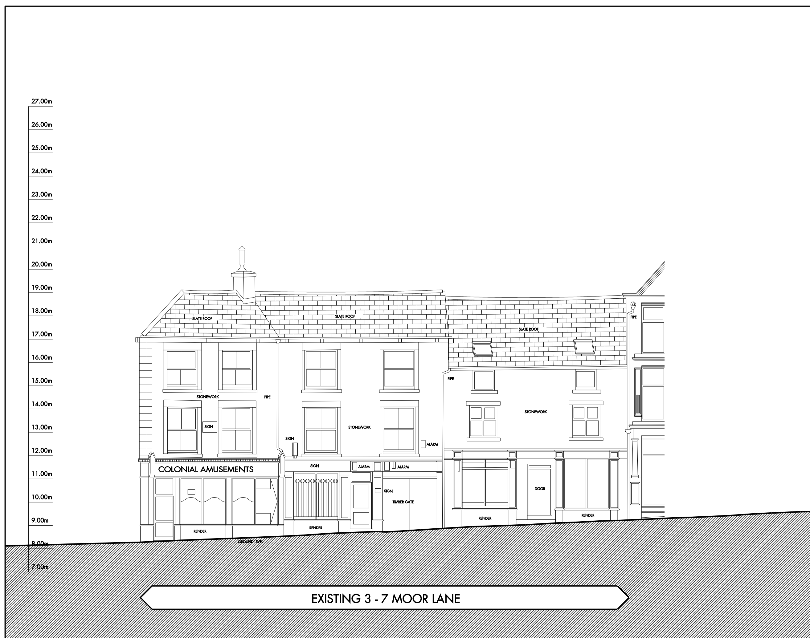
EXISTING ELEVATION C - C