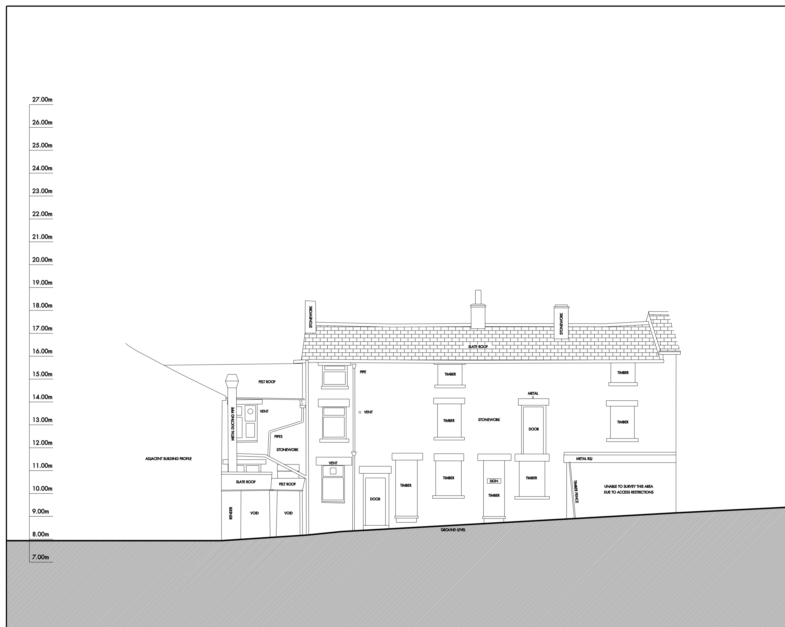
EXISTING ELEVATION D - D

REV D 27.04.07 ISSUED TO LANCASTER CITY COUNCIL CK